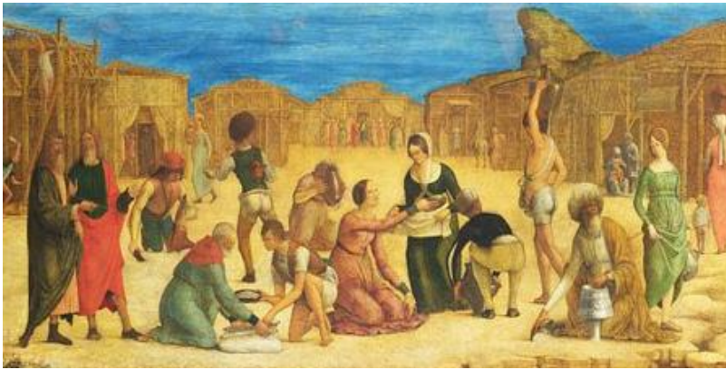
Israelites Gathering Manna