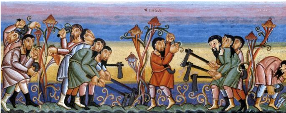
Parable of the Workers in the vineyard

After the homily, a period of silence is observed.